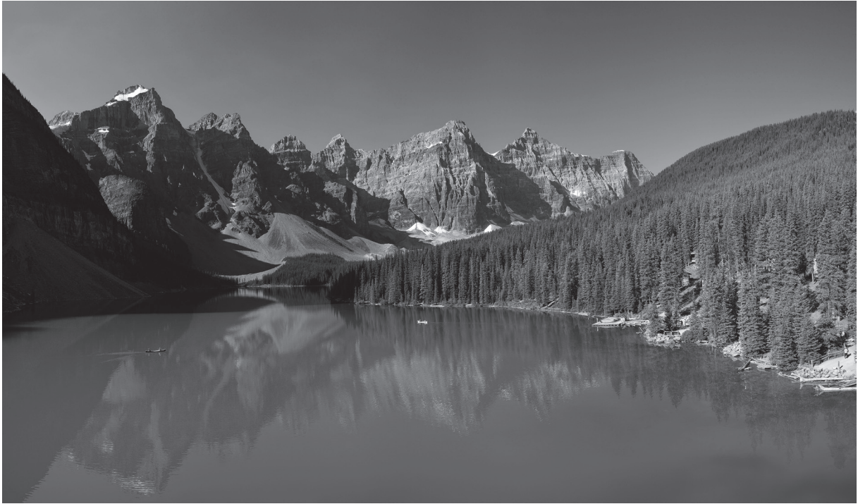
Fig. 2.1 for Question 2