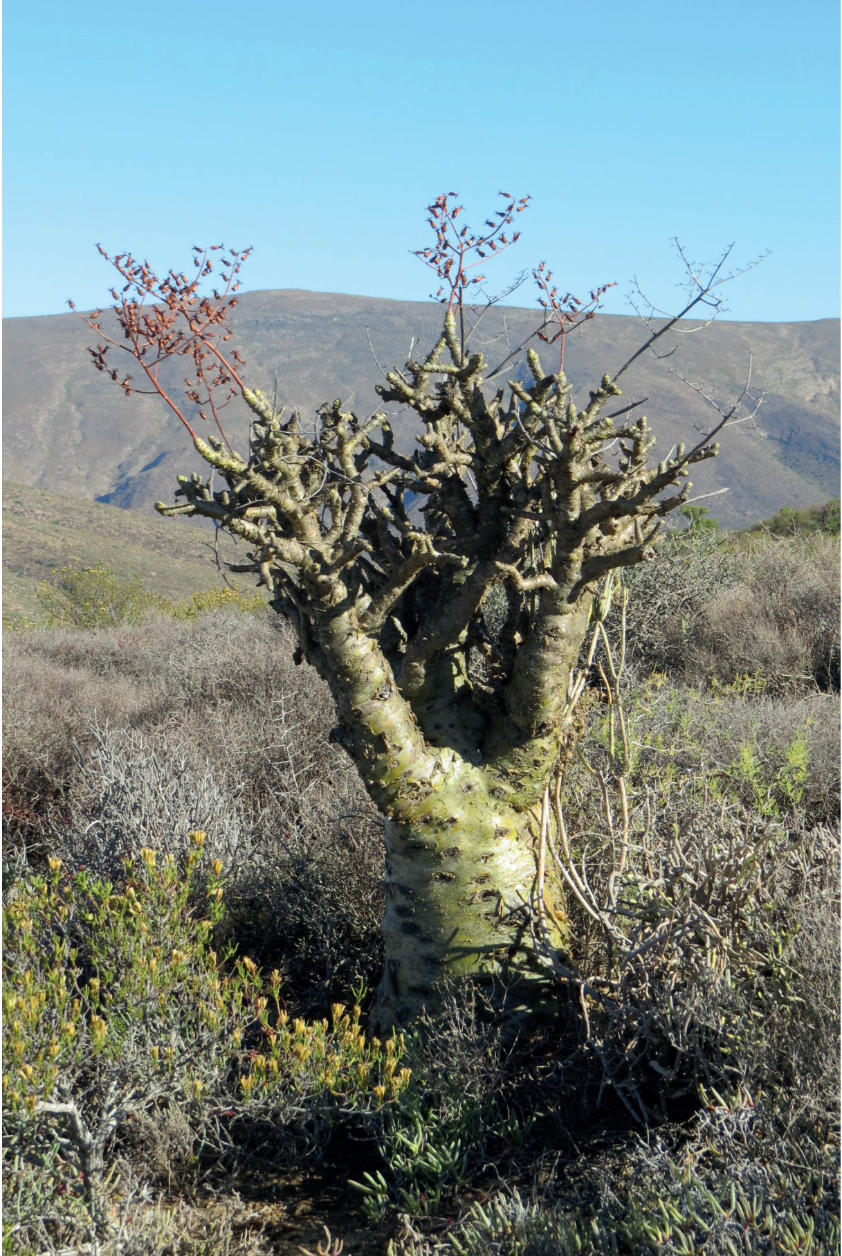
Photograph A for Question 4