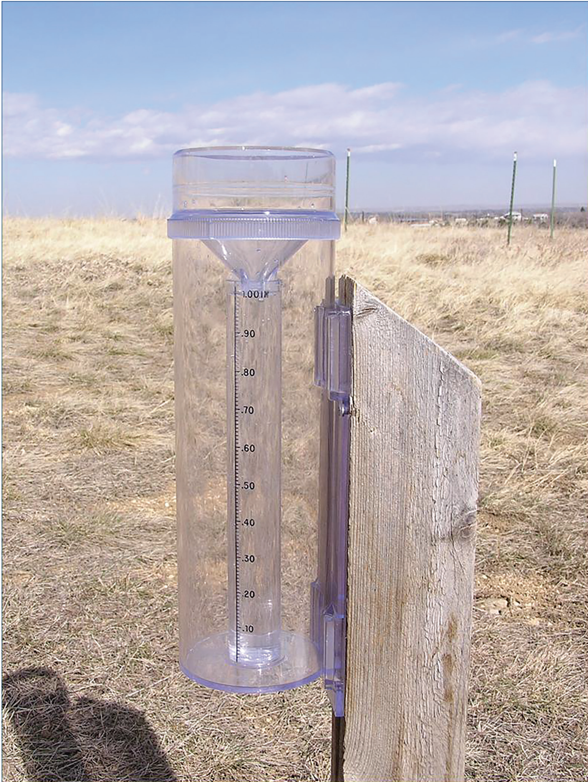
An instrument to measure rainfall