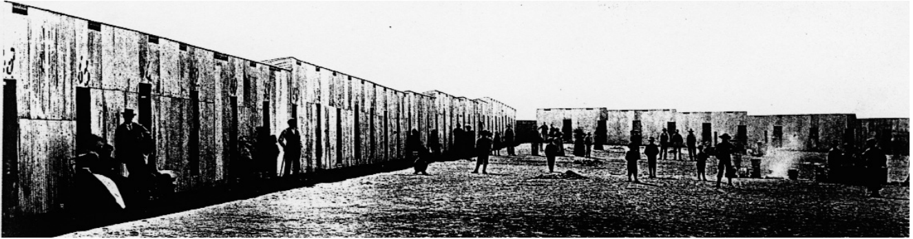
A concentration camp for Boers.

17 Study the photograph, and then answer the questions which follow.