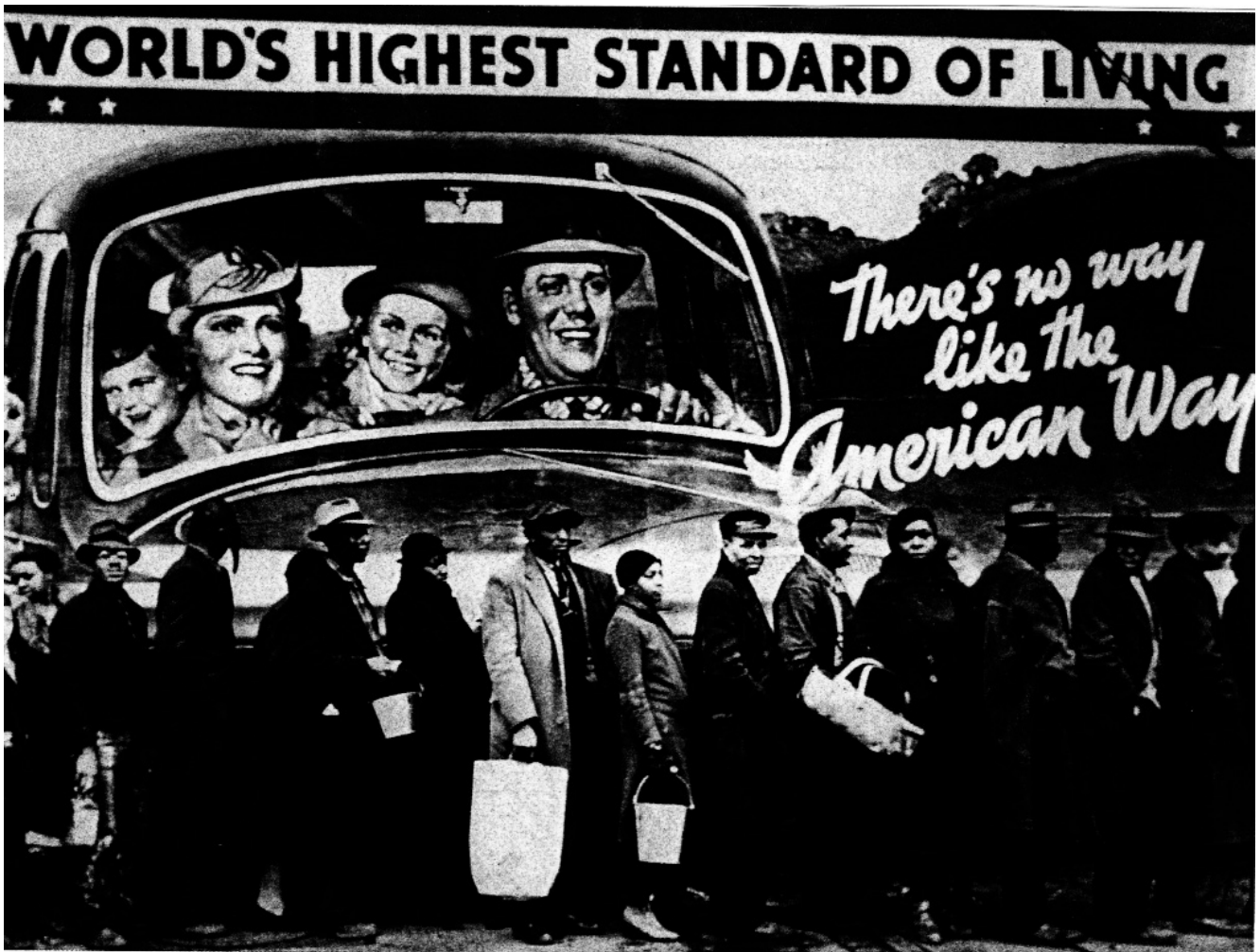
Unemployed people queuing for government relief in 1937.

14 Study the photograph, and then answer the questions which follow.