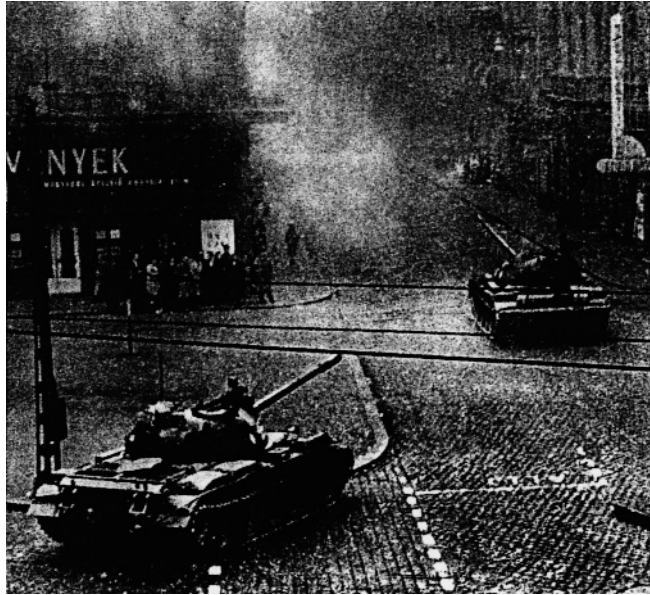
Soviet tanks in Budapest, November 1956.