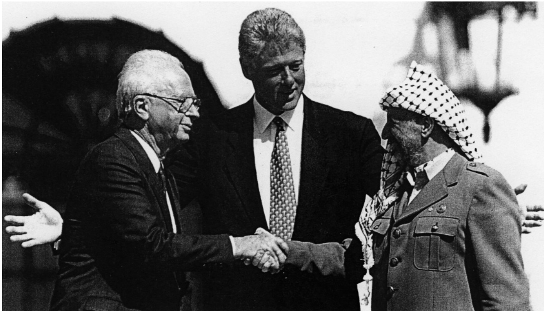
President Clinton with Rabin and Arafat after the signing of the Israeli-PLO peace accord, September 1993.

21 Study the photograph, and then answer the questions which follow.