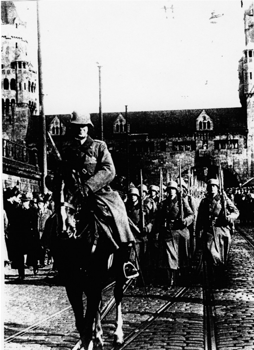
German soldiers entering Cologne in the Rhineland, March 1936.

6 Study the photograph, and then answer the questions which follow.