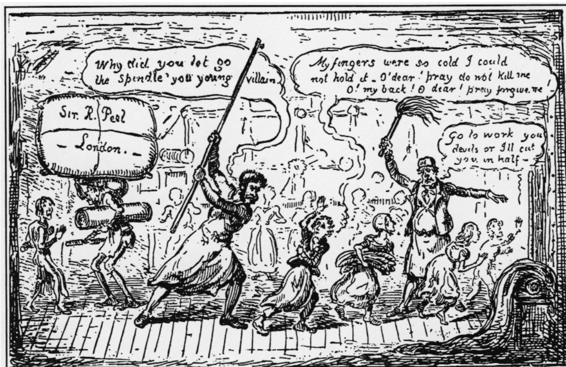
An early nineteenth century cartoon titled 'The Factory Slaves. Their daily employment'.

22 Study the cartoon, and then answer the questions which follow.