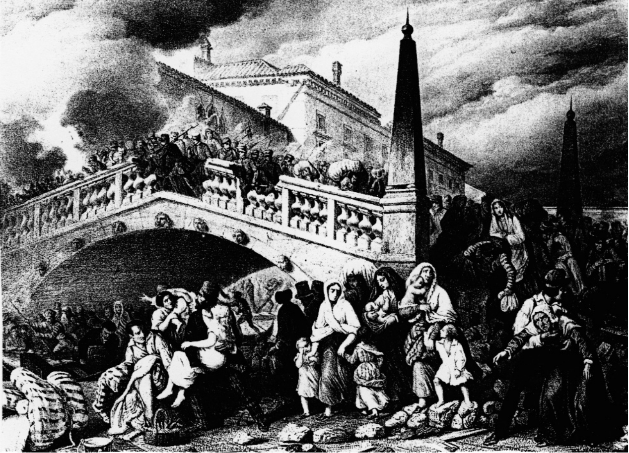
The siege of Venice, 1849