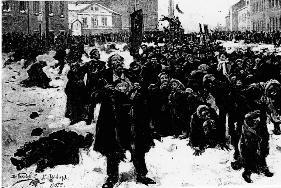
Bloody Sunday – a painting from c.1910.

11 Study the painting, and then answer the questions which follow.