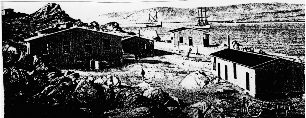
An early German trading post.

19 Study the picture, and then answer the questions which follow.