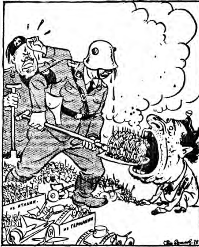
Рис. Бор. Ефимова.