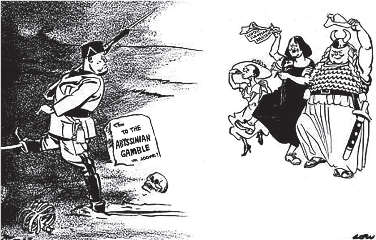
THE GIRLS HE LEFT BEHIND HIM

A British cartoon published in May 1935. The figures on the right are Goebbels, Hitler and Göring.