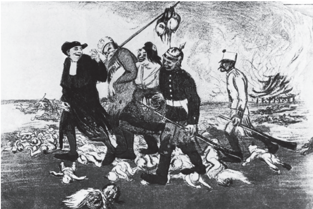
A cartoon published in a French magazine, July 1900. Its title is 'The expedition of the European powers against the Boxers'.