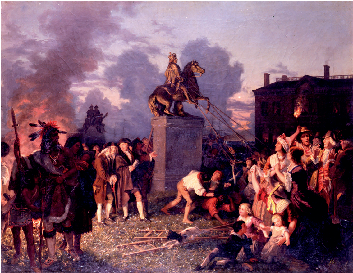
A painting showing the reactions of people in New York after the Declaration of Independence had been read out publicly, July 1776. The statue is of King George III.