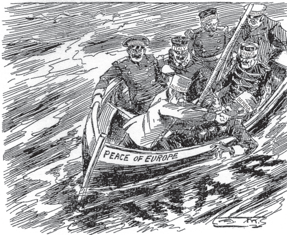
A cartoon published in Britain, 1 August 1914.