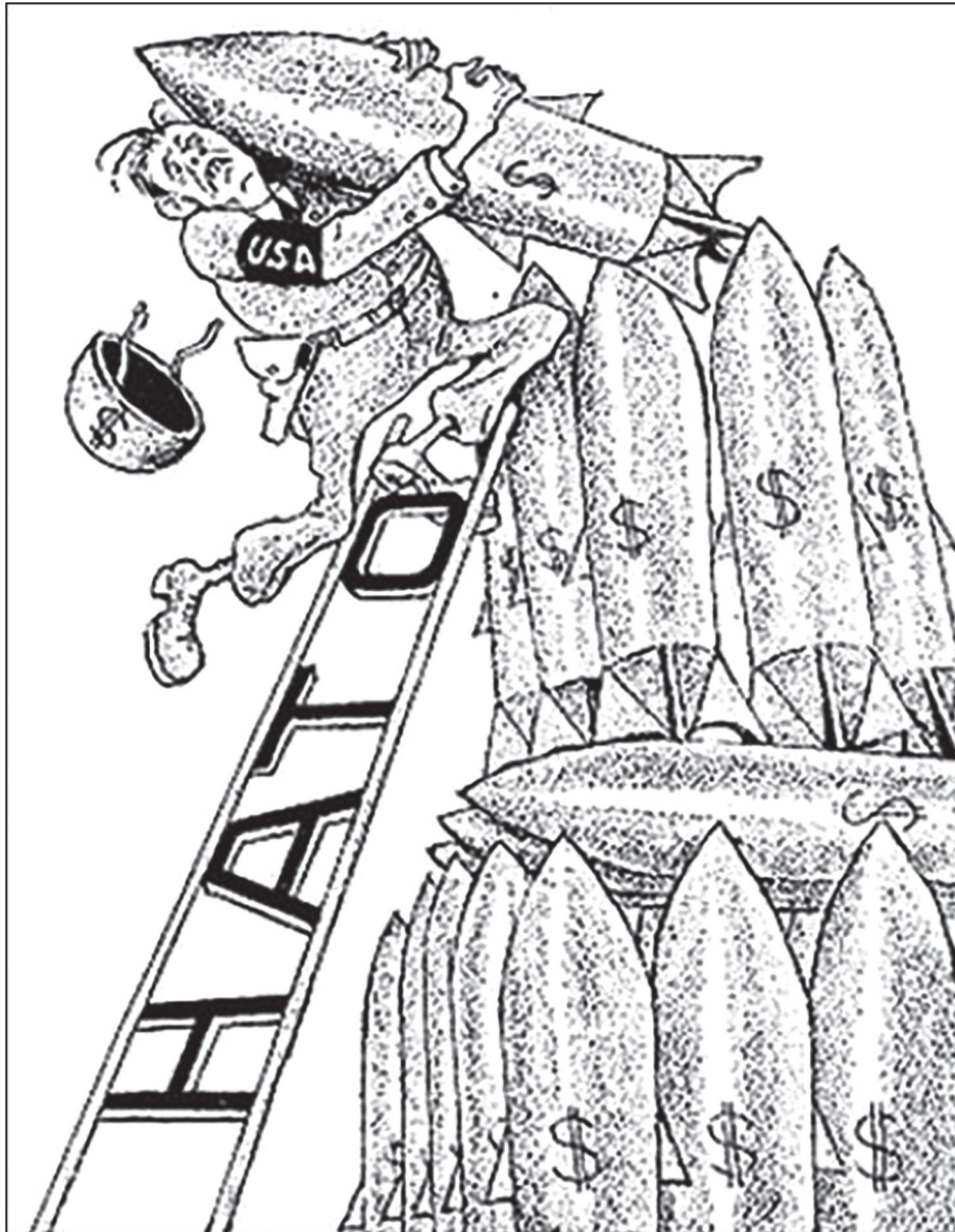
A cartoon published in the Soviet Union in 1949. The word on the ladder is 'NATO'.