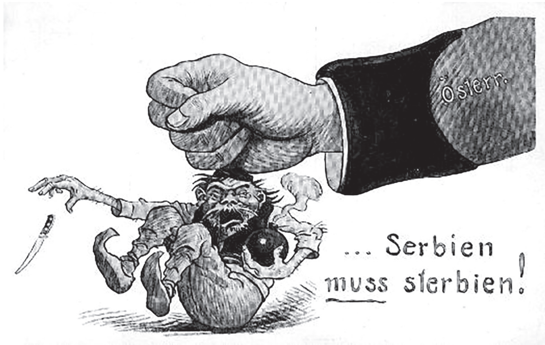
An Austrian cartoon published shortly after the assassination of Archduke Ferdinand. The words say 'Serbia must die!' 'Osterr' means Austria.